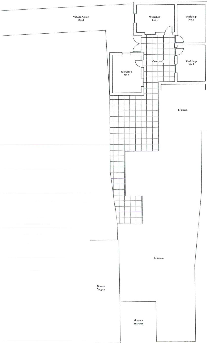
EXISTING GROUND FLOOR PLAN TO WORKSHOPS (MUSEUM & ASSOCIATED BUILDINGS SHOWN IN OUTLINE)